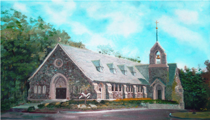
ST. JULIA CHURCH 374 BOSTON POST ROAD WESTON, MA

ST. JOSEPH CHURCH 142 LINCOLN ROAD LINCOLN, MA